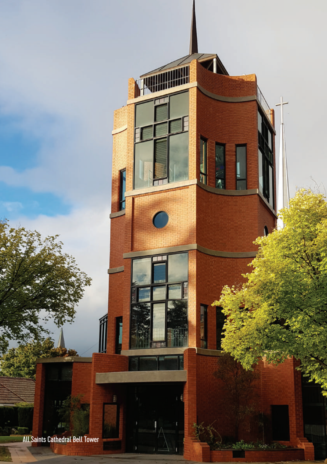
All Saints Cathedral Bell Tower