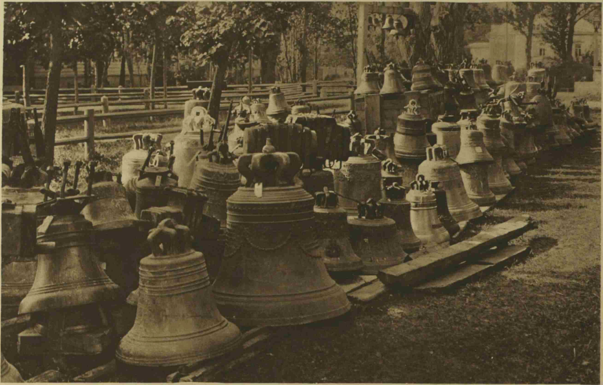
BROUGHT FROM MANY PARTS OF RUSSIA THAT THE INVADING ENEMY MIGHT NOT USE THEIR METAL TO MAKE SHELLS: RUSSIAN CHURCH-BELLS—EACH LABELLED.